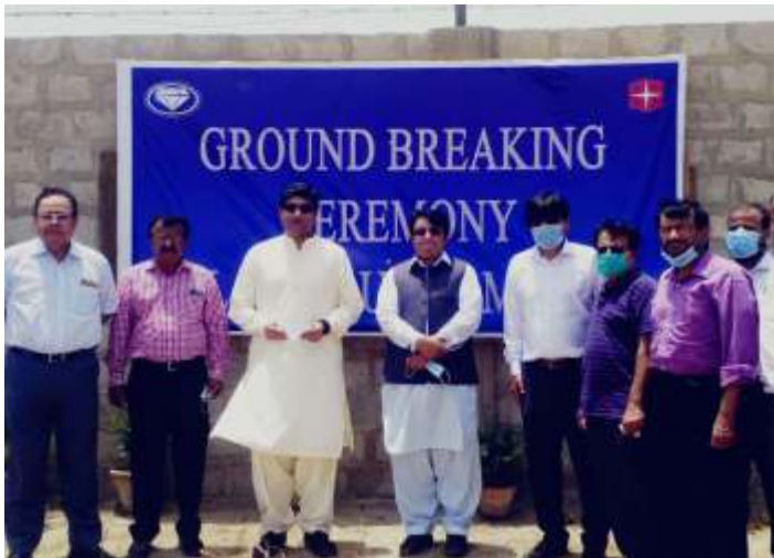
GM Policy-EDB at the Ground Breaking of Al-Haj Bus Company (Pvt) Ltd

Al-Haj Bus Company was awarded Greenfield Status under ADP 2016-21 in April 2020, after which Al-HAJ started work of Bus Manufacturing Plant.