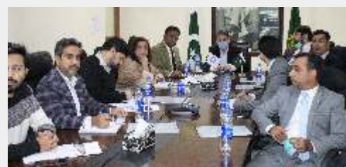
CEO-EDB chairing consultative sessions for formulation of a National Petrochemical Policy 2021

The policy initiative has been proposed by petrochemical companies of