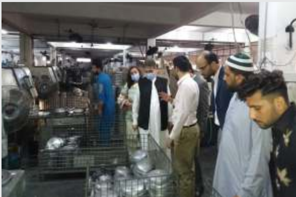
CEO –EDB , General Manager (BDG)-EDB and team accompanied by Chairman, Pakistan Electric Fan Manufacturers Association (PEFMA) visited Rafique Engineering (Gujrat)