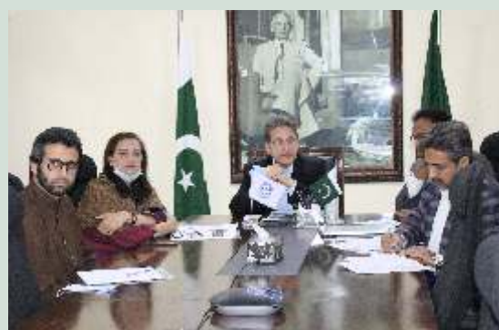
Online consultative session with stakeholders from power equipment sector chaired by CEO-EDB, along with senior officials of EDB