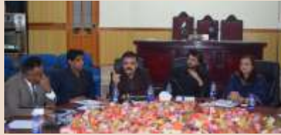
EDB's visit to Surgical Instrument Manufacturers Association (SIMAP)

EDB's team visited Surgical Instrument Manufacturers Association (SIMAP), Sialkot on 9 th November, 2021 to deliberate on the draft report prepared to enhance competitiveness of Surgical Instrument Industry of Pakistan. The said report was a result of a joint study of the sector conducted by EDB and the Pakistan Business Council (PBC). The objective of this visit was to get inputs/feedback from the industry to finalize the report. The meeting was attended by the members of SIMAP, Director Research PBC, General Manager (BDG) EDB and General Manager (SDG) EDB.