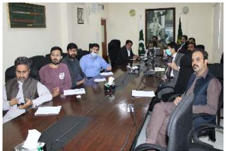
Meeting on Criteria for Computing the Landed Cost Factor chaired by GM (SDG)-EDB

Company Ltd. (SSGC) and Sui Northern Gas Pipe Line (SNGPL) and after detailed deliberations, a criterion for computation of Landed Cost Factor was revised as given in the table. (continued on next page).