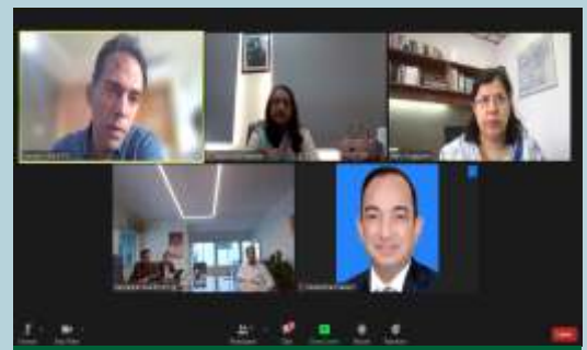
GM (BDG) -EDB along with senior officials of BoI and PTA addressing the queries of Mercantile Group