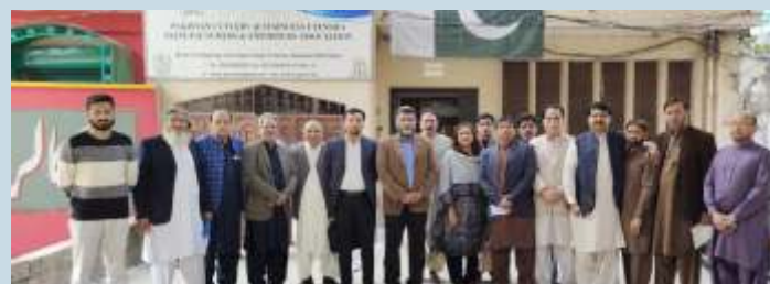
GM (BDG) –EDB and DM(BDG)-EDB along with senior officials from PBC welcomed by Pakistan Cutlery & Stainless Utensils Manufacturers & Exporters Association in Wazirabad

During the discussion, members of the Association stated that they are making efforts to enhance the exports of Cutlery and Kitchen Wares products and to minimize imports of the local needs of national market. The Association informed that presently the sector is receiving lower duty drawback rates as compared to other sectors, which requires to be enhanced in order to increase exports. The Association also informed that cargo rates for them were also on the higher side as compared to other sectors. The members of the association also desired to participate in trade delegations to other countries and in various exhibitions in the target