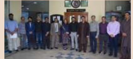
Members of SIMAP, Director Research PBC, General Manager (BDG) EDB and General Manager (SDG) EDB

Besides this, EDB's team visited M/s. Hilbro International, Sialkot to see their manufacturing processes, product quality and to better understand the issues being faced in exports, especially with reference to the Medical Device Regulations (MDR), which if not complied with, may become an irritant. EDB assured to take up all these matters at concerned forums for implementation once the report is finalized.