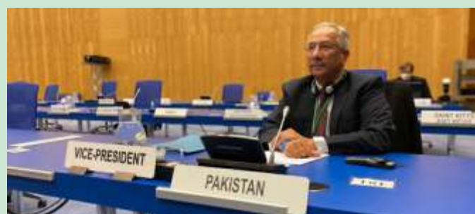
H.E. Ambassador Aftab Ahmad Khokher addressing the 19 th Session of UNIDO's General Conference

solutions and result-oriented policy interventions for job creation and poverty alleviation. Ambassador Khokher acknowledged the support of UNIDO for implementing many projects in Pakistan aimed at indigenous capacity building and technical assistance in various sectors. UNIDO has assisted Pakistan for increasing competitiveness of industrial products through testing, monitoring, standardization and certification for conformity